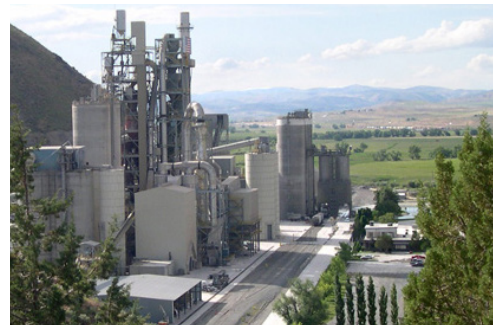
Ash Grove Cement, Durkee.

Erdemir Mining Industry & Trade – Ermaden Group, Sivas, Turkey. New burner system for iron ore pelletizing kiln: Including accessories, natural gas and fuel oil valve trains as well as BMS engineering. Main target is to modernize the plant and allow simultaneous usage of fuel oil and natural gas while keeping the emissions under control.