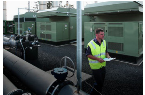
LMS Energy, Australia.

Vale Oman Pelletizing Company, Sohar, Oman. CFD modeling of iron ore pelletizing kiln burner.