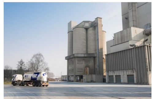
CBR Cimenteries - Heidelberg Group, Antoing, Belgium.